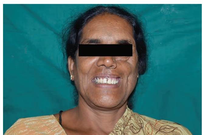
Fig. 8: Posttreatment frontal profile picture

The number, position, health of the remaining teeth and the size, and location of the defect are important for determining the position and number of occlusal and incisal rests. Multiple occlusal rests improve support