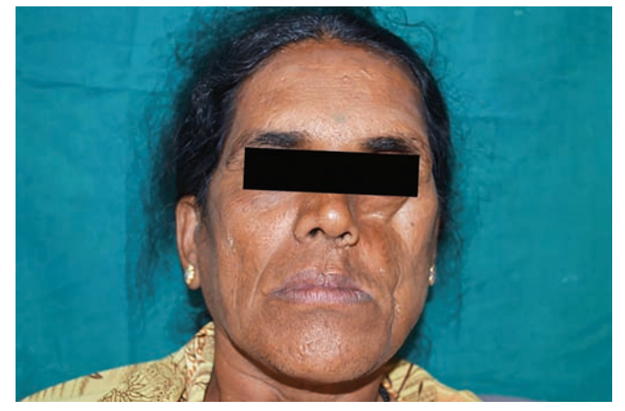
Fig. 2: Pretreatment frontal profile picture