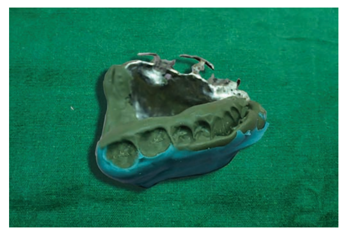
Fig. 5: Neutral zone and centric relation record